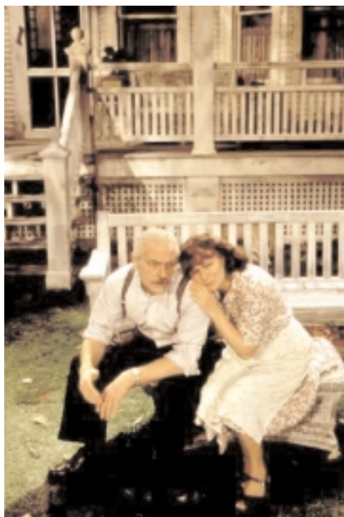
James Hazeldine Julie Walters

It is a fundamental tenet of Miller's drama that the private and the public world are intertwined. As he is fond of saying, the fish is in the water and the water is in the fish. But so, too, are the past and the present. We are, he insists, responsible for one another, responsible for our actions, for who we are. All My Sons stages that truth.